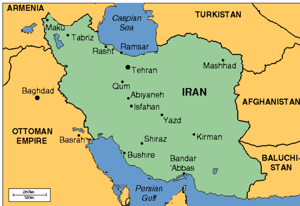
Iran in the nineteenth century