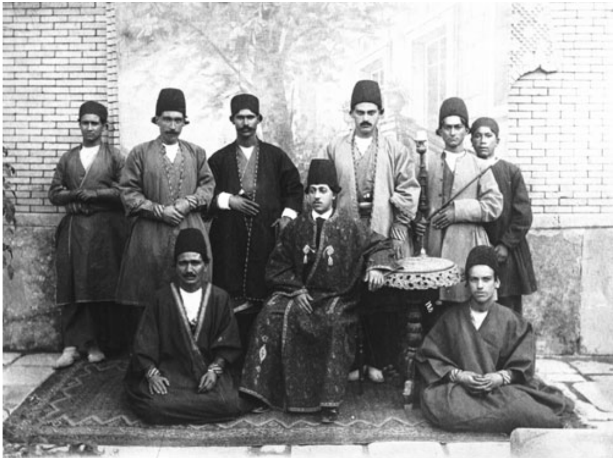
An important provincial official surrounded by his entourage. The seated official is wearing a western style shirt with collar under his elaborate overcoat (RMV no. 3219).

The Hotz collection of Qajar era dress is unique in Europe, America, and indeed Iran. There are no other large collections of dress that can be so accurately dated (1883). Another factor that makes this collection so important is that Hotz bought complete outfits, rather than individual items of clothing. This means that we can now develop a good understanding of the construction and appearance of dress, especially for men, from a period that saw great social and economic changes in Iran.