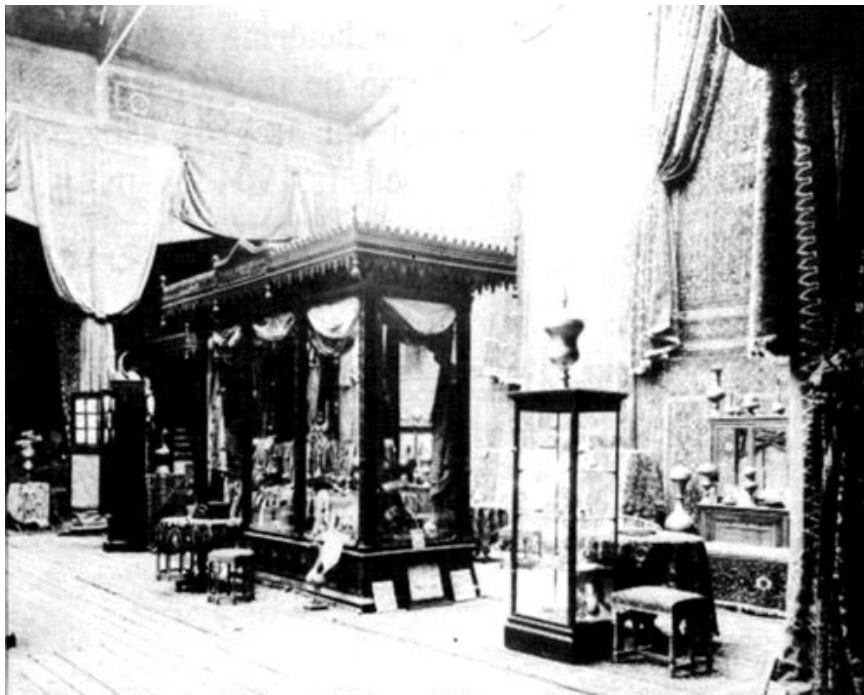
The Persian section at the International, Colonial and General Exportation Exhibition, Amsterdam 1883