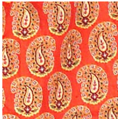
Buteh, detail van RMV 503-275